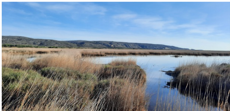
Black-winged stilt on the Salses lagoon