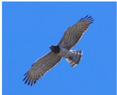
Picnic spot with the Short-toed eagle

We spent the rest of the day around Garrieux, where we saw a group of 42 White stork, Red kite, Black kite, and two Stone curlew in a field. And to end the day on a high note, the Hoopoe came alongside the cars to say goodbye.