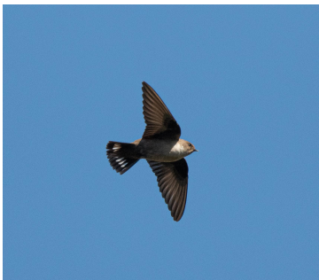
Crag martin

On down into the village where Chris managed to get a sneaky photo of an Alpine accentor on a wall while we were all looking elsewhere! Down the steps and along the newly opened path that continues to overlook the Briant, but water levels in the Briant and the Cesse rivers were