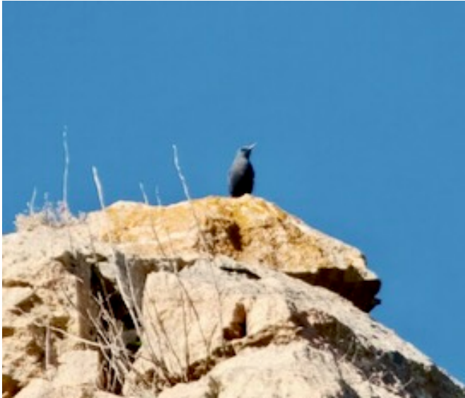
Blue rock thrush

It too was preening and we all got excellent views in the scope. Then it caught a very large flying insect (we think a moth), which it took quite a while to kill and then eat! Quite a spectacular scene, and one we all felt quite privileged to have witnessed, knowing how hard these furtive birds are to find. As if that wasn't good enough, Ian had seen a darkish bird flitting around at the top of the cliffs above the Wallcreeper and finally it decided to show itself... at last a beautiful male Blue rock thrush, which eventually came right out onto the top of the rock, and we all got excellent views of this elegant bird in the sunshine.