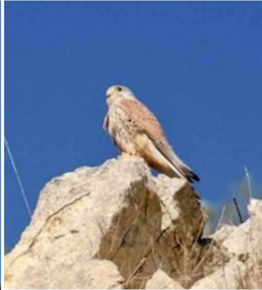
Common kestrel

We heard Green woodpecker (which may have been an Iberian or a northern Green or even a hybrid – as we didn't actually see it). Out of the sun it was quite chilly so we wrapped the day up at about 16h.