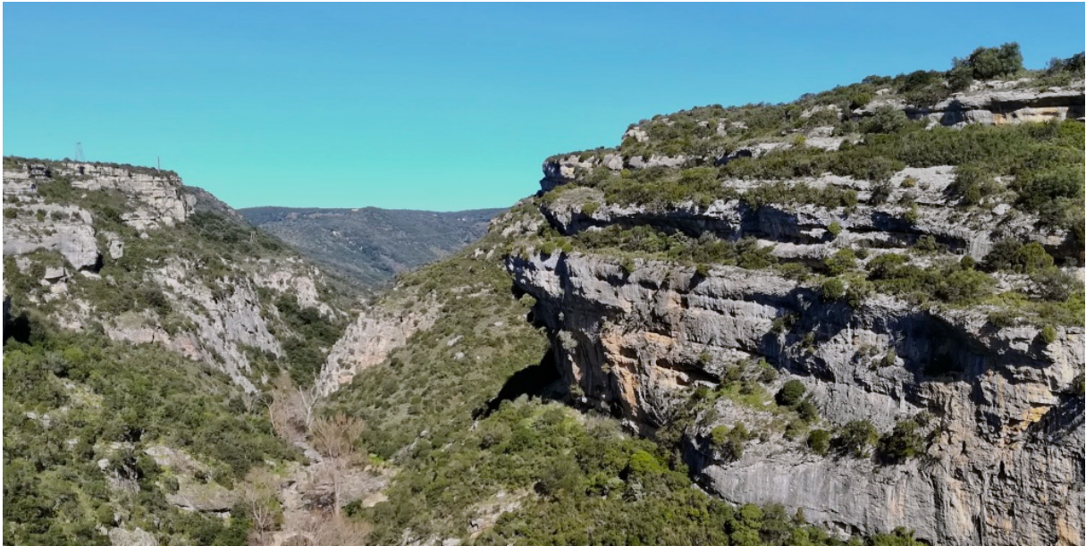
Gorges du Briant – Minerve

We started out from the top carpark at Minerve and made our way down the road into the village. Our first stop overlooking the Briant gorge offers good views towards plenty of rock face, but despite plenty of eyes to scan, no Wallcreeper were seen. We did however see a number of Jackdaws (flying around noisily all morning), quite a few Crag martins and a Raven collecting nesting material.